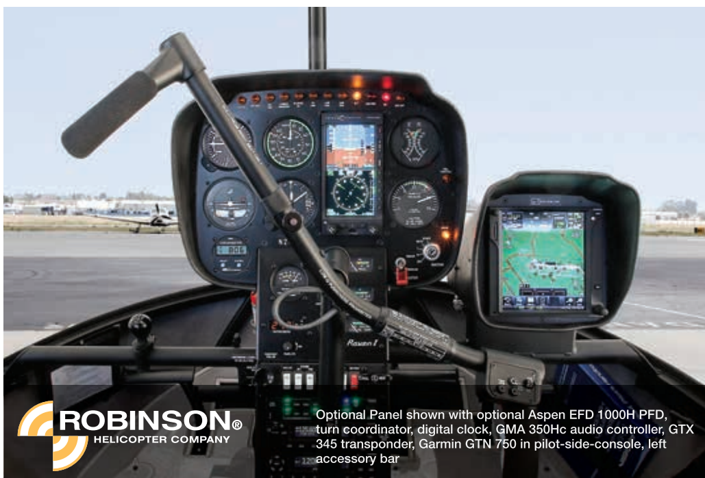
Optional Panel shown with optional Aspen EFD 1000H PFD, turn coordinator, digital clock, GMA 350Hc audio controller, GTX 345 transponder, Garmin GTN 750 in pilot-side-console, left accessory bar