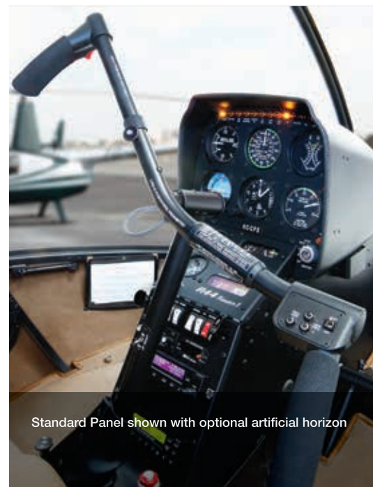
Standard Panel shown with optional artificial horizon