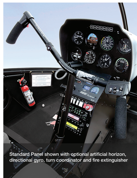
Standard Panel shown with optional artificial horizon, directional gyro, turn coordinator and fire extinguisher