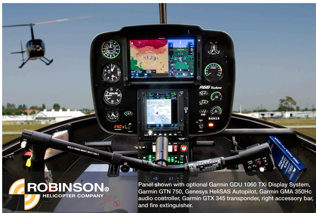
Panel shown with optional Garmin GDU 1060 TXi Display System, Garmin GTN 750, Genesys HeliSAS Autopilot, Garmin GMA 350Hc audio controller, Garmin GTX 345 transponder, right accessory bar, and fire extinguisher.